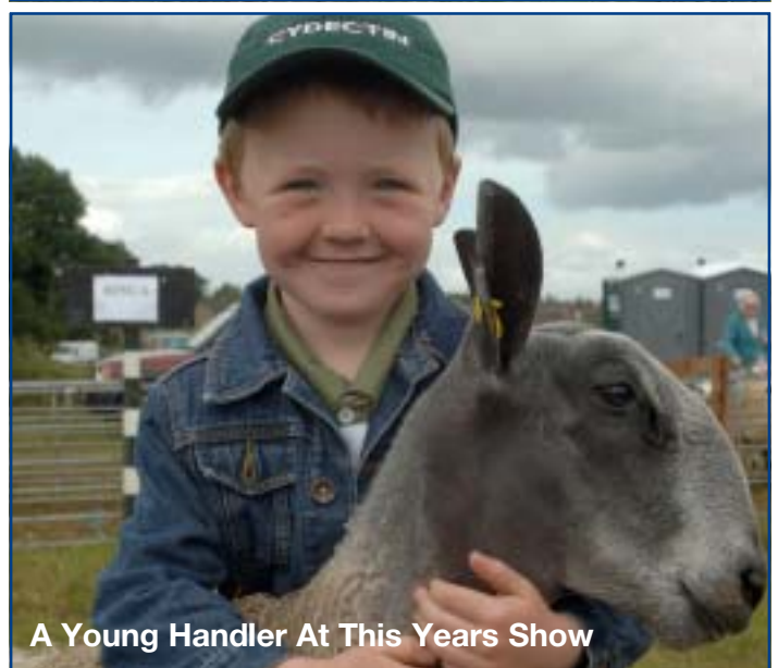
A Young Handler At This Years Show