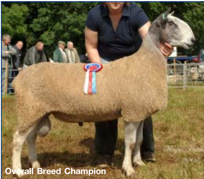
Overall Breed Champion