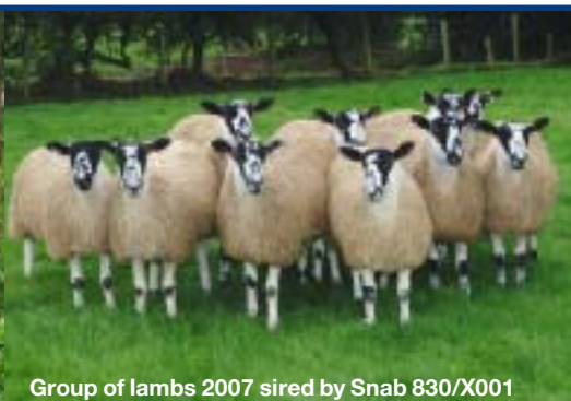
Group of lambs 2007 sired by Snab 830/X001