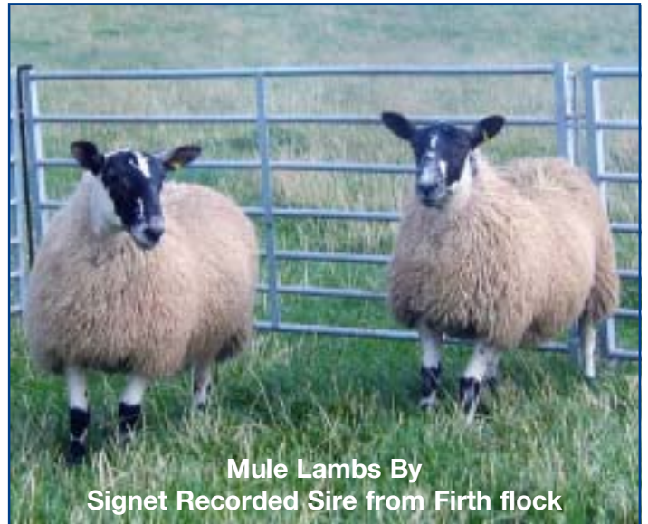
Mule Lambs By Signet Recorded Sire from Firth flock