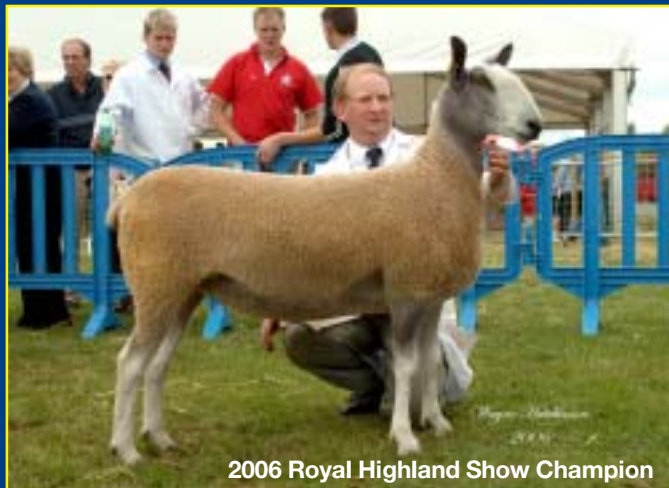
2006 Royal Highland Show Champion