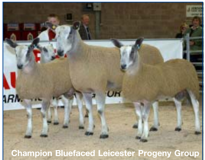
Champion Bluefaced Leicester Progeny Group