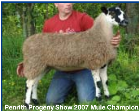
Penrith Progeny Show 2007 Mule Champion