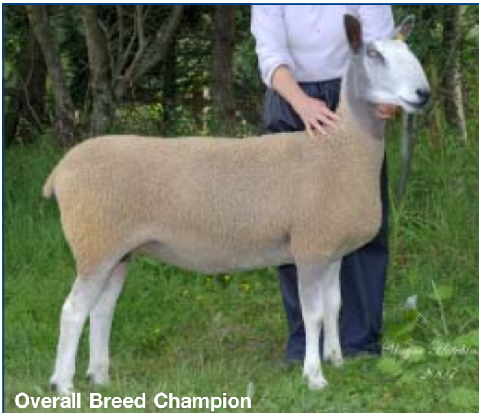
Overall Breed Champion