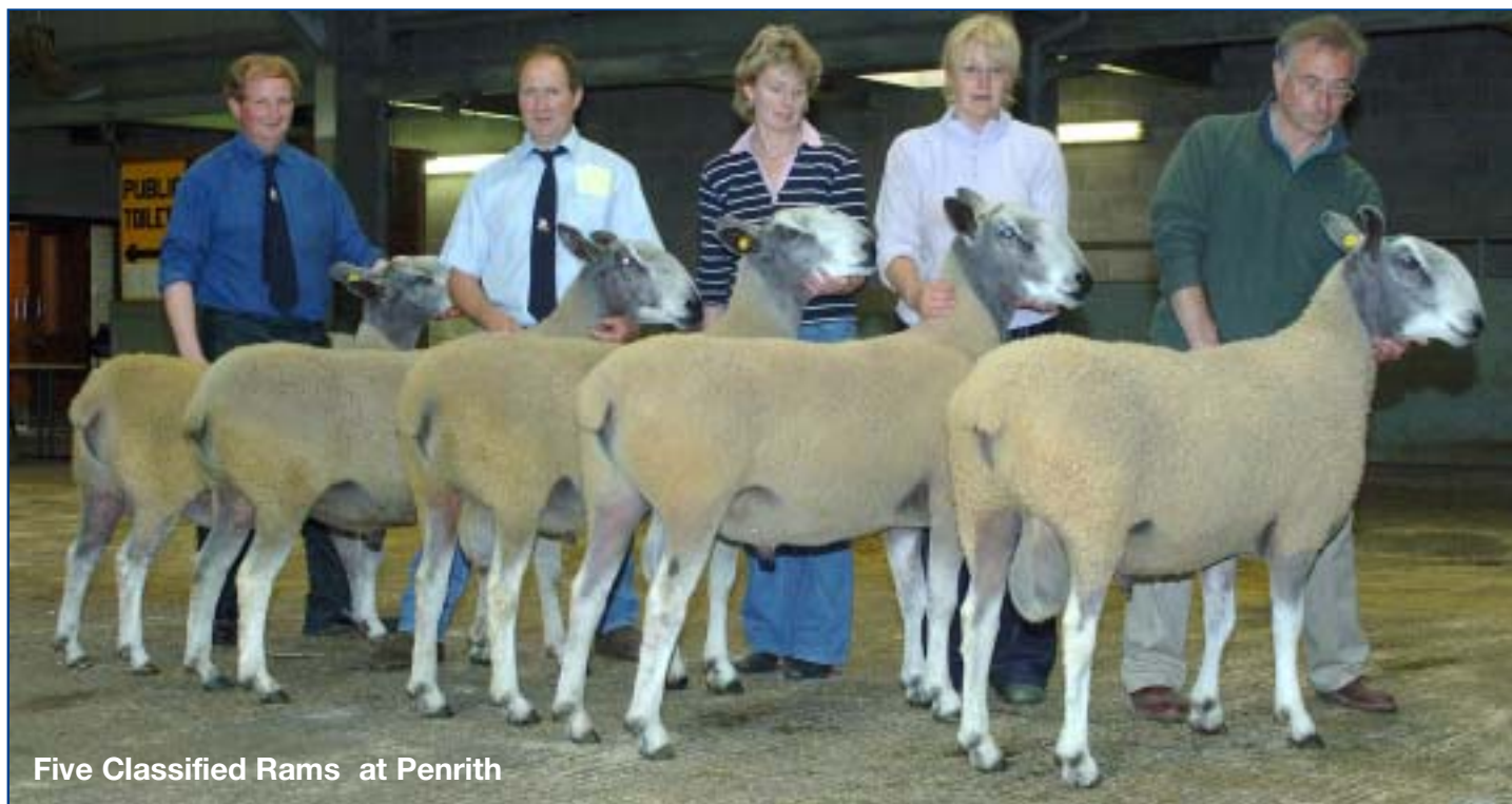
Five Classified Rams at Penrith