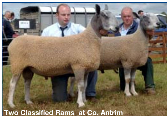
Two Classified Rams at Co. Antrim