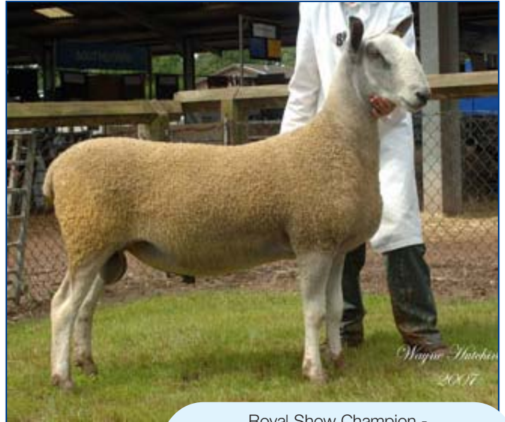
Royal Show Champion - A Fotheringham - Craighall flock (Judge - Wallace Parker - Hall Mains flock)