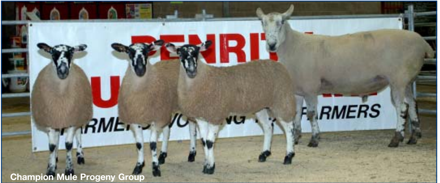
Champion Mule Progeny Group