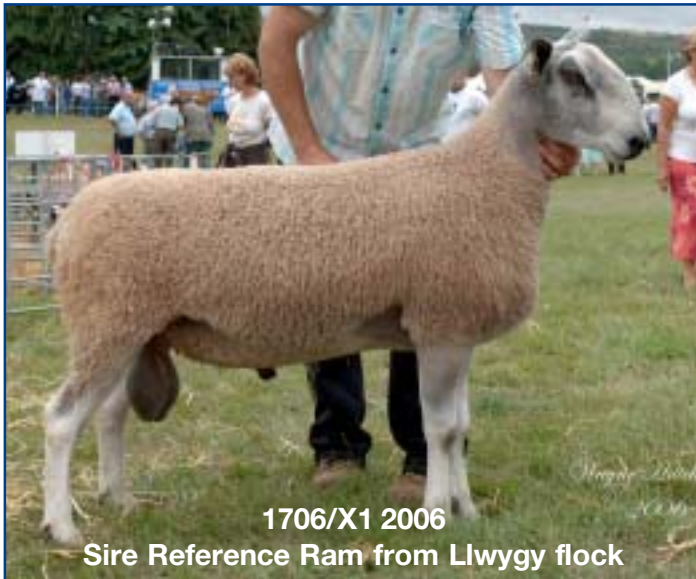
1706/X1 2006 Sire Reference Ram from Llwyg flock