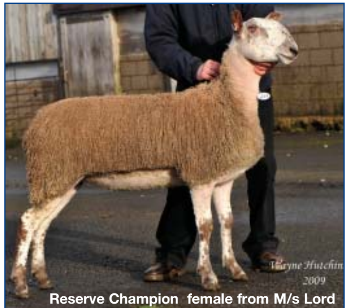
Reserve Champion female from M/s Lord