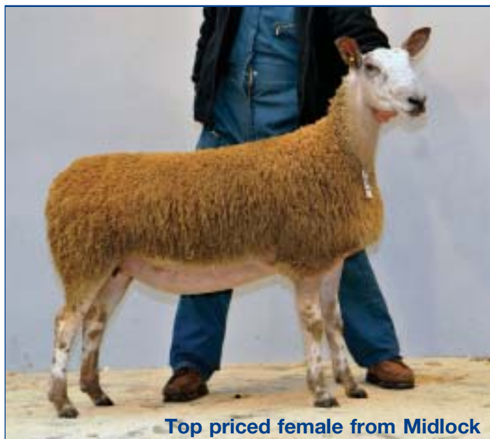
Top priced female from Midlock

A packed ringside braved the elements to attend the annual Carlisle Bluefaced Leicester in lamb sale, which saw a good trade. Whilst not quite up to last years dizzy heights for a single sheep, on the whole trade was excellent with 14 lots going above the 1000 gns mark and saw averages soaring way above last years trade.