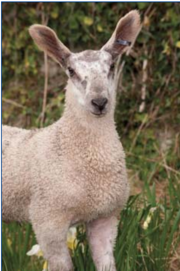
2009 born lamb