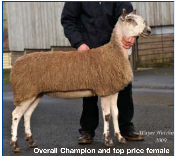
Overall Champion and top price female

Forward 39 Sheep Overall average £693. Gimmer Hoggs to £3000 Av £966.