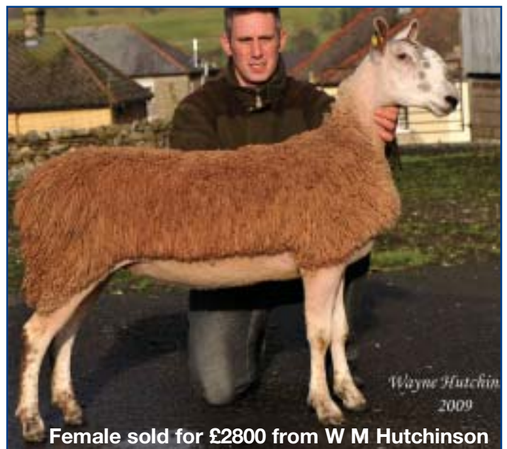
Female sold for £2800 from W M Hutchinson