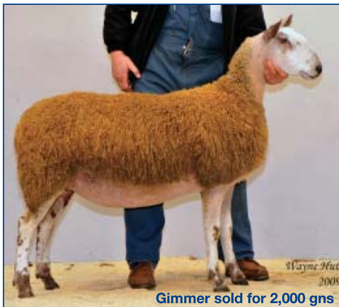
Gimmer sold for 2,000 gns