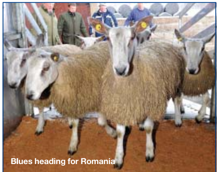
Blues heading for Romania