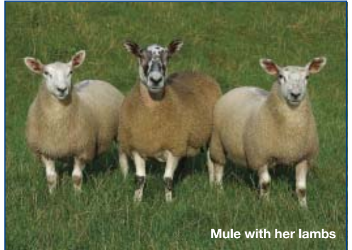
Mule with her lambs

The UK MULE brand will enable the Bluefaced Leicester Association to promote the great attributes of the MULE such as ease of management and unrivalled financial output. Many Mules in the UK are not represented by an Association, so this will give them the opportunity to be promoted as well as the ones already promoted by their own Mule Associations. A meeting was held with various Mule Associa-