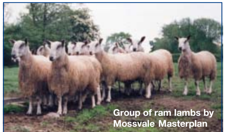
Group of ram lambs by Mossvale Masterplan

We have a logo "better not bigger, wider not taller, built to last, bred to stay".