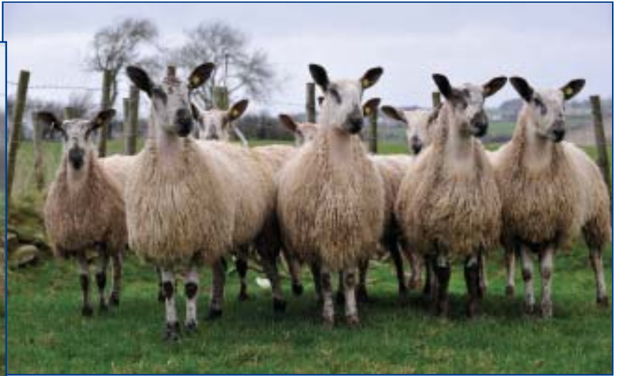
Hundith flock in their home surroundings

the Haining House flock for £600 and did such an outstanding job. It was sold for £4200 as a seven shear, such was its reputation.