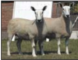
Cheviot Mule Gimmers

Overall Commercial Champions - Royal Show 2006