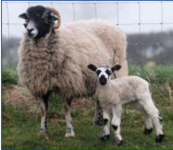
A Swaledale ewe and her lamb