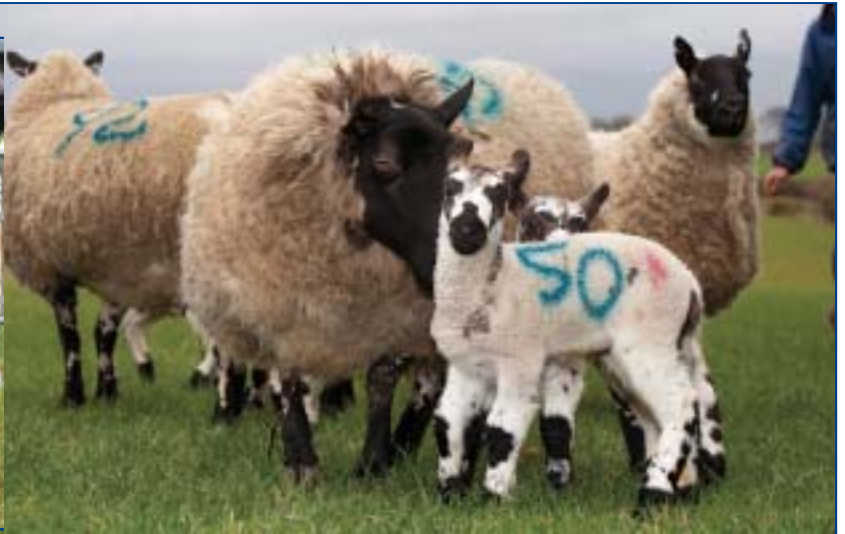
Three times winner of the Royal Welsh Show sired by the £6400 T4 Carryhouse