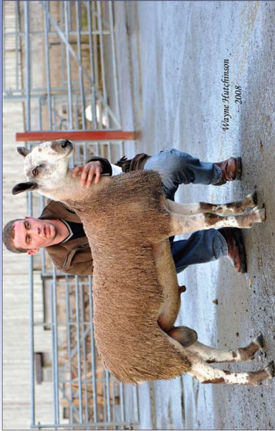
292/A001 HAWES TOP PRICE 2008 bred and exhibited by Messrs Lawson & Sons, HUNDLITH, purchased by W A & A Booth, SMEARSETT sold for £11,500